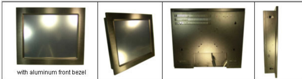
with aluminum front bezel

17" industrial LCD Monitor with Aluminum front bezel and optional Touch-screen - 1280 x 1024 resolution, 300 cd/m2, 16.77 million colors